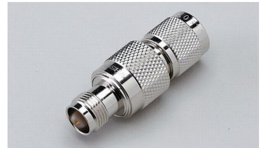
100% Lead-Free (RoHS Compliant)