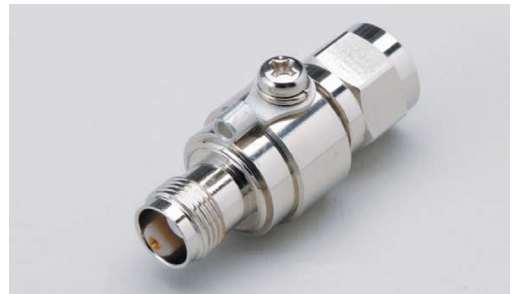
100% Lead-Free (RoHS Compliant)