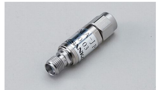
100% Lead-Free (RoHS Compliant)