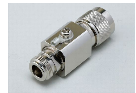
100% Lead-Free (RoHS Compliant)