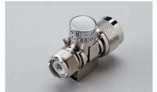
100% Lead-Free (RoHS Compliant)