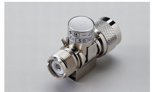
100% Lead-Free (RoHS Compliant)