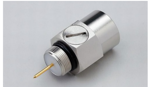
100% Lead-Free (RoHS Compliant)